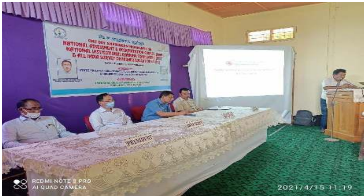
Resource persons of the one day sensitization programme on NAAC, AISHE & NIRF-2021 on 15 th April 2021.