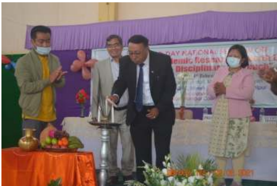
Photo1. Candle lighting