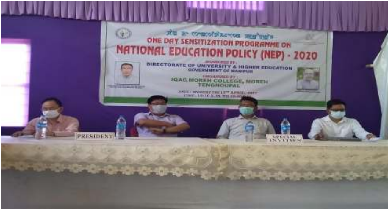
Resource Persons of NEP 2020 at Moreh College, Moreh