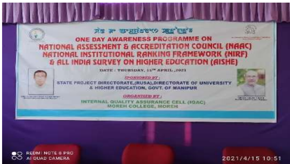
Banner of one day sensitization programme on NAAC, AISHE & NIRF-2021