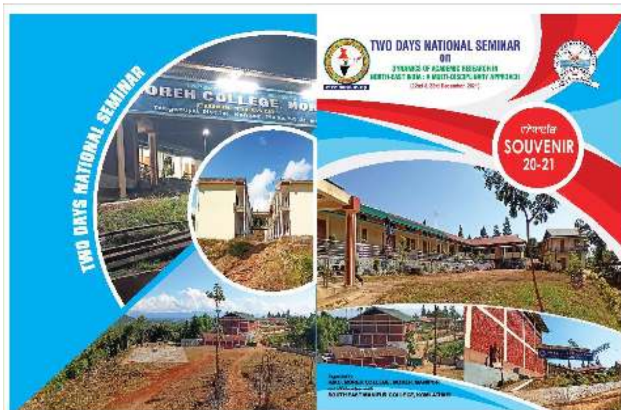
Souvenir Front and Back View Photograph