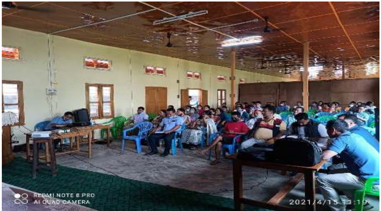
Audience during the one day sensitization programme on NAAC, AISHE & NIRF-2021