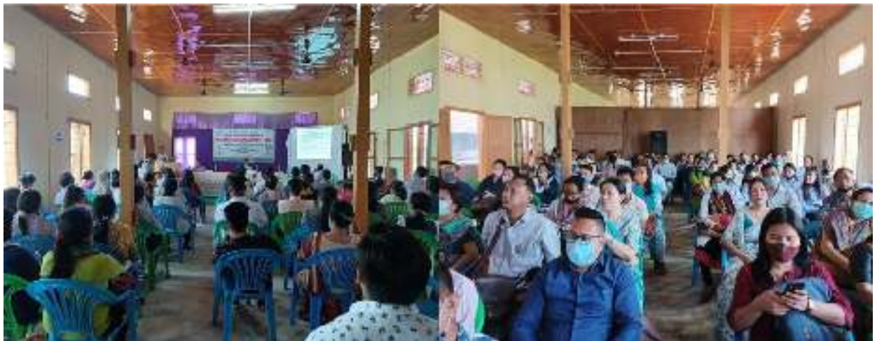
Participants of Sensitization Programme on NEP 2020 at Moreh College, Moreh